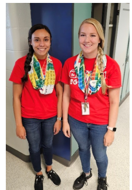
TWIN DAY! Need we say more...