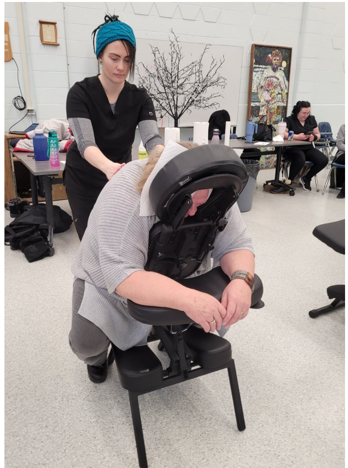
Students from the Institute of Massage came to offer staff and students free 10 minutes massages for Wellness Wednesday!